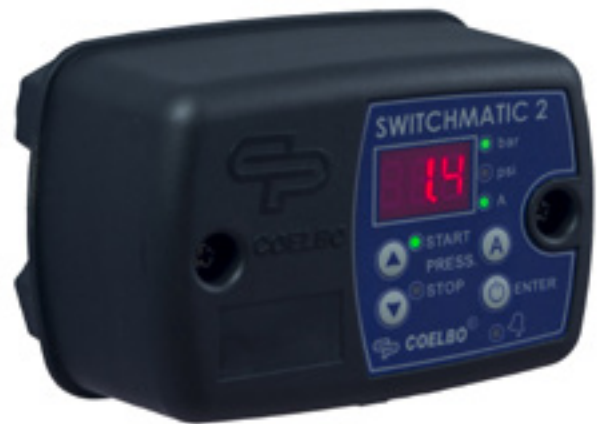
SWITCHMATIC 1 SWITCHMATIC 2 SWITCHMATIC 2/in-out