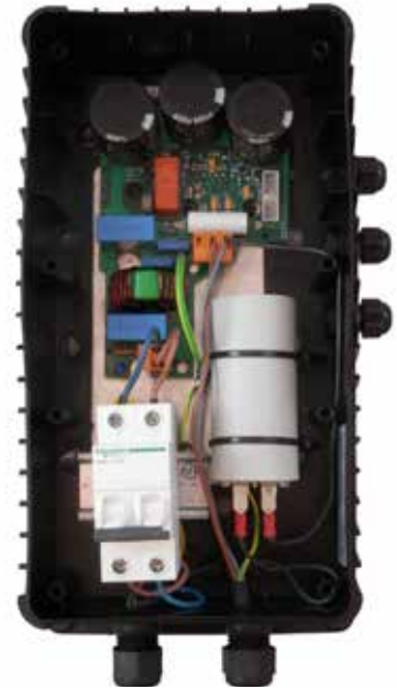
SUB 1112 MM