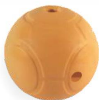
Shell Counterweight - 230g.