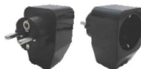
Schuko piggyback plug